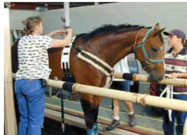
VETERINARY TEACHING HOSPITAL AT UC DAVIS

UC Davis is a premier research university, the largest employer in Yolo County and has an annual economic impact of more than $1.4 billion. The UC Davis Medical Center ranks among the nation's best hospitals and is the region's only academic medical center. The UC Davis Burn Center serves two million residents across the region. The recently opened Robert and Margrit Mondavi Center for the Performing Arts hosts a wealth of cultural and artistic performances in District 5.