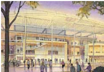
UC DAVIS AND UC DAVIS MEDICAL CENTER

UC Davis is a premier research university, the largest employer in Yolo County and has an annual economic impact of more than $1.4 billion. The UC Davis Medical Center ranks among the nation's best hospitals and is the region's only academic medical center. The UC Davis Burn Center serves two million residents across the region. The recently opened Robert and Margrit Mondavi Center for the Performing Arts hosts a wealth of cultural and artistic performances in District 5.