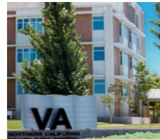
VA NORTHERN CALIFORNIA HEALTH CARE SYSTEM

The Veterinary Teaching Hospital at UCD is the only veterinary teaching hospital in California and provides services to more than 27,000 animals each year. UC Davis' Center for Equine Health (CEH) is leading the way in research to unravel the mysteries of colic, the painful abdominal malady that is the number one killer of horses. The School of Vet Medicine's new Kenneth L. Maddy Equine Analytical Chemistry Lab will provide drug testing for California racehorses as well as studies evaluating the effectiveness of medications and other products on racehorse performance.