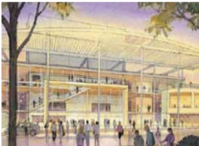
UC DAVIS AND UC DAVIS MEDICAL CENTER

UC Davis is a premier research university, the largest employer in Yolo County and has an annual economic impact of more than $1.4 billion. The UCD Medical Center ranks among the nation's best hospitals and is the region's only academic medical center. The medical center operates an AIDS Clinical Trial Unit, a regional Burn Center - that serves 2 million residents across the region, a Nursing Research Center and the Center for Health Services Research - that provides research on the cost and quality of primary care medicine. The newly opened Mondavi Center for the Performing Arts hosts a wealth of cultural and artistic performances in District 8.