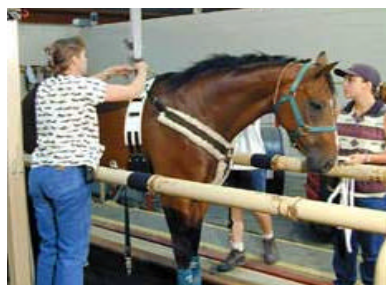
UC DAVIS VET MED CENTER

UC Davis is a premier research university, the largest employer in Yolo County and has an annual economic impact of more than $1.4 billion. The UCD Medical Center ranks among the nation's best hospitals and is the region's only academic medical center. The medical center operates an AIDS Clinical Trial Unit, a regional Burn Center - that serves 2 million residents across the region, a Nursing Research Center and the Center for Health Services Research - that provides research on the cost and quality of primary care medicine. The newly opened Mondavi Center for the Performing Arts hosts a wealth of cultural and artistic performances in District 8.