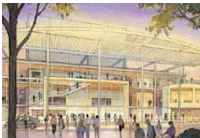
UC DAVIS AND UC DAVIS MEDICAL CENTER

UC Davis is a premier research university, the largest employer in Yolo County and has an annual economic impact of more than $1.4 billion. The UC Davis Medical Center ranks among the nation's best hospitals and is the region's only academic medical center and Level 1 Trauma . The UC Davis Burn Center serves two million residents across the region. The recently opened Robert and Margrit Mondavi Center for the Performing Arts hosts a wealth of cultural and artistic.