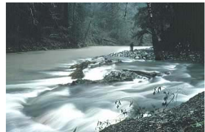
UC NATURAL RESERVES

The Veterinary Teaching Hospital at UC Davis is the only veterinary teaching hospital in California and provides services to more than 27,000 animals each year . UC Davis' Center for Equine Health (CEH) is leading the way in research to unravel the mysteries of colic, the painful abdominal malady that is the number one killer of horses. The School of Veterinary Medicine's new Kenneth L. Maddy Equine Analytical Chemistry Lab will provide drug testing for California racehorses as well as study and evaluate the effectiveness of medications and other products on racehorse performance.