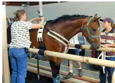
UC DAVIS VET MED CENTER

UC Davis is a premier research university, the largest employer in Yolo County and has an annual economic impact of more than $1.4 billion. The UC Davis Medical Center ranks among the nation's best hospitals and is the region's only academic medical center and Level 1 Trauma . The UC Davis Burn Center serves two million residents across the region. The recently opened Robert and Margrit Mondavi Center for the Performing Arts hosts a wealth of cultural and artistic.