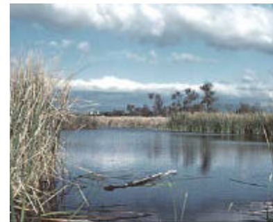
UC NATURAL RESERVE

The UC Irvine Medical Center has a strong academic reputation in neurosciences, cancer and genetics research. The UC Irvine Medical Center in Orange, the Long Beach Veterans Affairs Medical Center and the Long Beach Memorial Medical Center provide cutting-edge medical research to the general population and to a disproportionate share of the area's poor and uninsured. UCI Medical Center's 462-bed facility is Orange County's only designated comprehensive emergency service and Level I Trauma Referral Center.