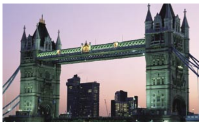
Top to bottom: London Bridge (UK), Arch of Triumph (France), Mayan pyramid (Mexico)

"In essence, EAP allows the world to become the classroom for UC students,