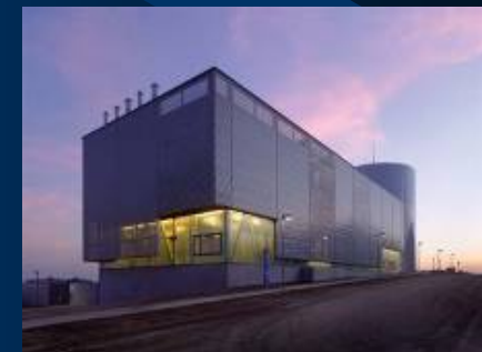
Central Plant, UCM – LEED Gold