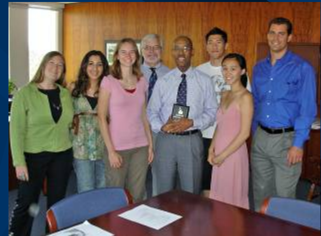
UC Irvine Chancellor Drake meeting with representatives of environmental student groups