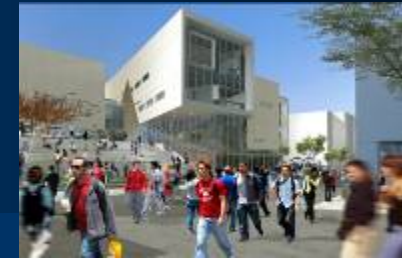
Price Center, UCSD – UC Silver