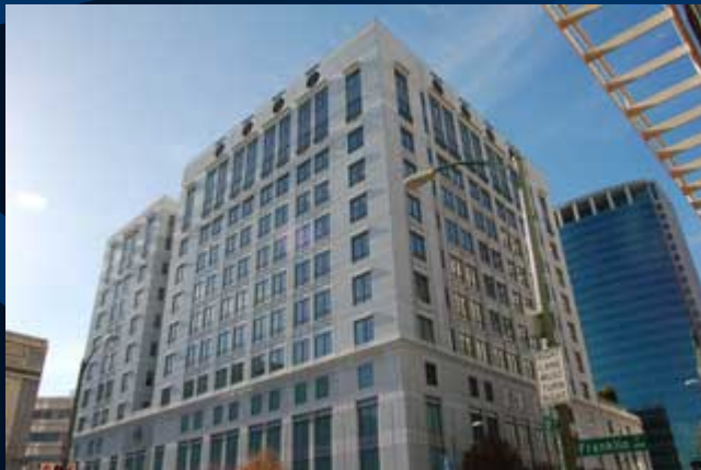
UCOP Franklin Building, LEED-EB Silver (2007)