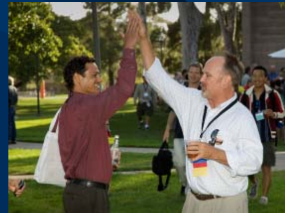
Award winners and attendees at the 6 th Annual UC/CSU/CCC Sustainability Conference, UC Santa Barbara June 2007