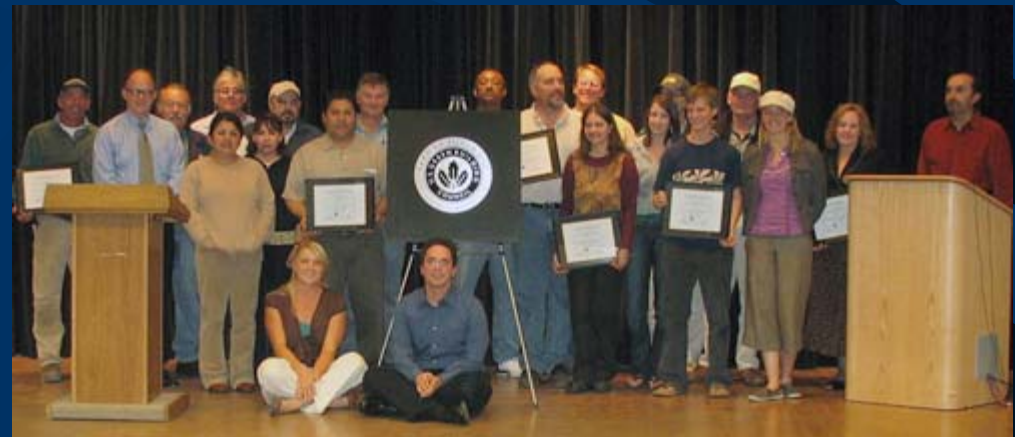
UCSB's Girvetz Hall Project team receiving LEED-EB Silver plaque (2005)