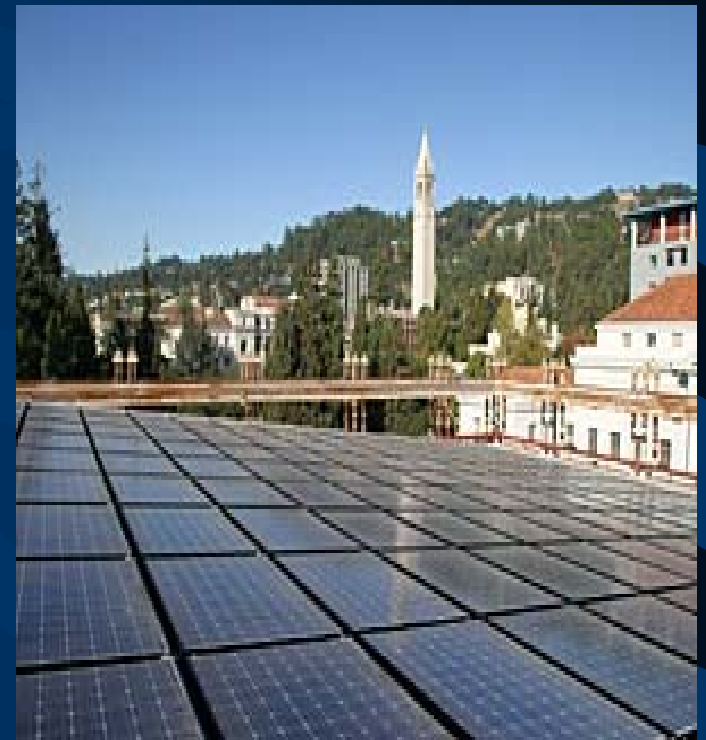
UC Berkeley's 120 kW PV array, located on Martin Luther King Student Center roof