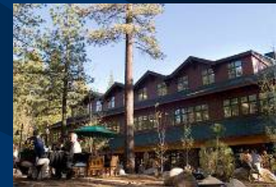
Tahoe Center, UCD – LEED Platinum